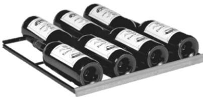
Sliding shelf MDS L40