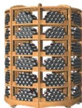
Around a pillar Ø 1800mm H2060mm