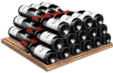
Storage shelf* AXUH